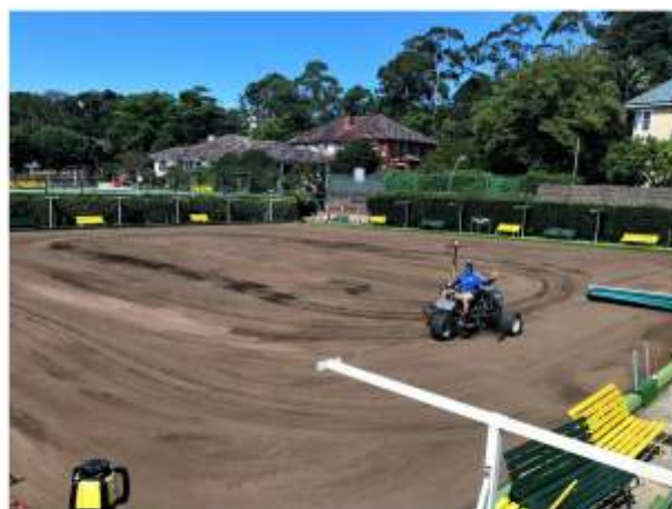
(Killara Bowling Club)