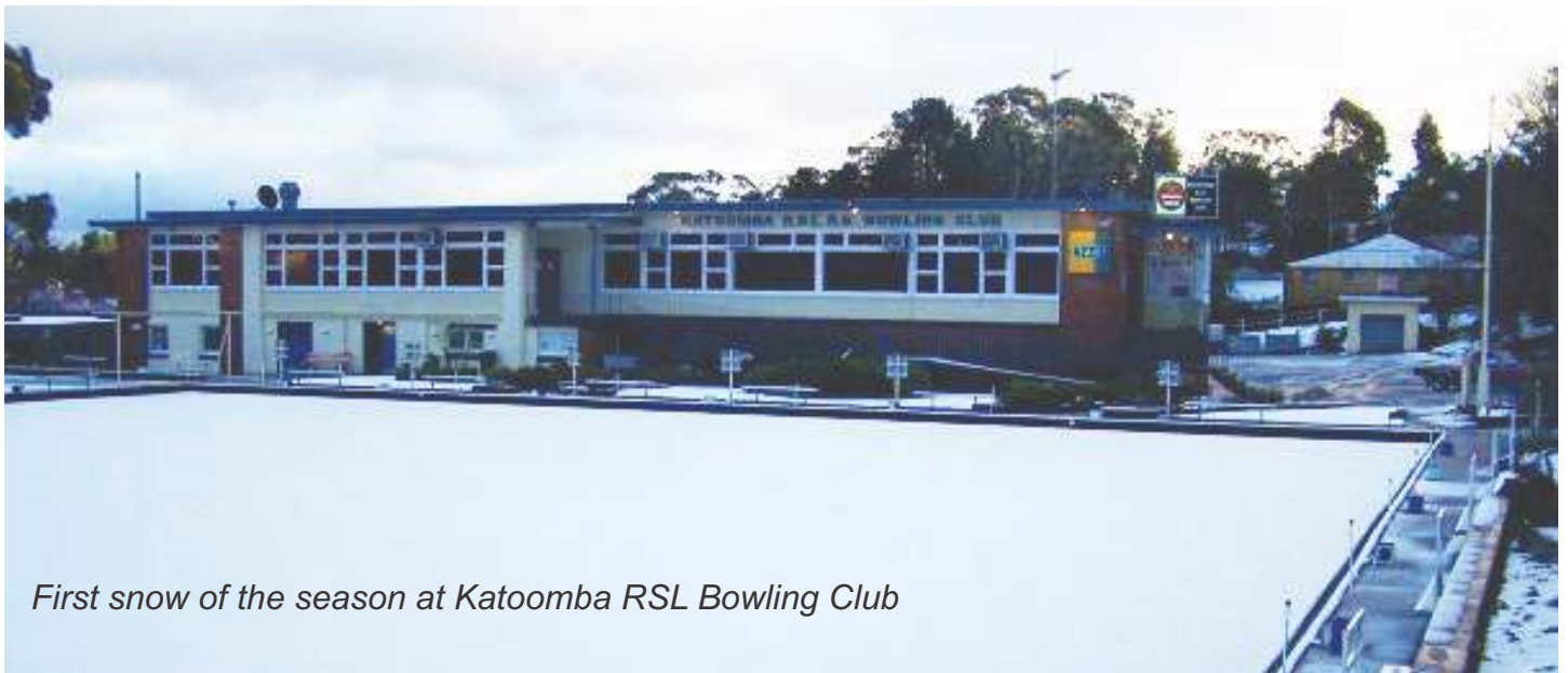
First snow of the season at Katoomba RSL Bowling Club

Contact the Editor to book your next advertisement in The Bowling Greenkeeper .