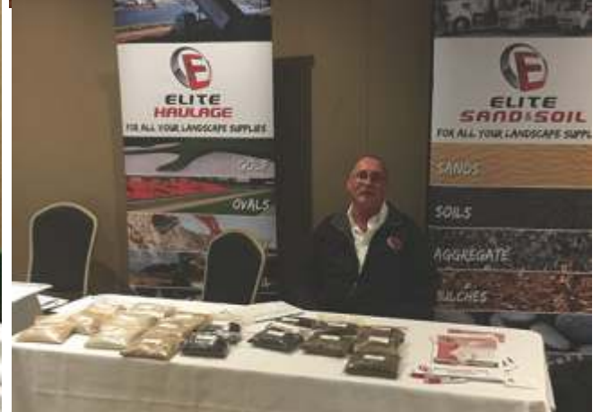
Pictured: Sponsors' trade displays and a presentation from one of the 2019 Gold Sponsors Syngenta Australia.