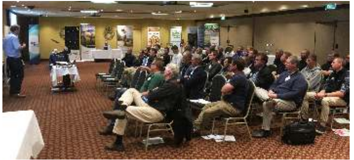
Pictured: Conference session and Globe Sponsor Display.

On the back of a successful trade day at Engadine earlier in the year the NSWBGA will be looking at hosting a similar event in the new year.