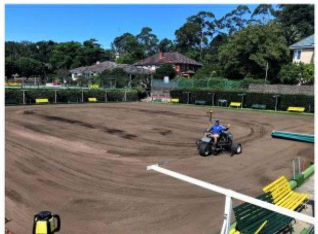
(Killara Bowling Club)